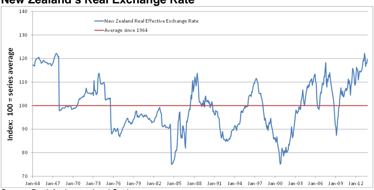
Figure 1: New Zealand's Real Exchange Rate